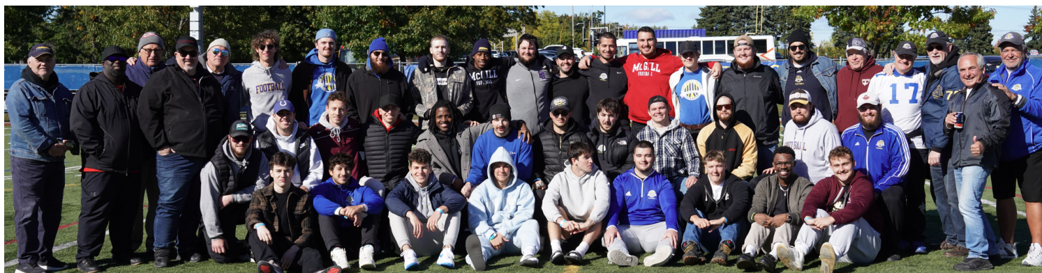
Football alumni at Homecoming 2024

Third year Paramedic student, John Abbott College, Recipient of Rubin and So Bursaries